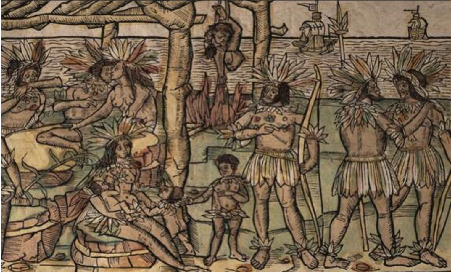
Fig. 2. The origin of the use of the image of a native woman to represent America dates back to the early sixteenth century. Pamphlets and illustrations of the people and the land, such as this 1505 German woodcut, were meant to attract newcomers to venture across the ocean to settle where native inhabitants wore feathered head-dresses and shared the bounty of the land.

rency, and had come to be the symbol of the Western Hemisphere. 2 Europeans first associated the Americas with depictions of a dark-skinned, full-bodied woman wearing a feathered headdress and a skirt of tobacco leaves. Over the years the image became somewhat more lithe and lighter in complexion. Around the beginning of the nineteenth century the image of America transformed from a stylized Indian woman to a Roman or Greek goddess in features as well as dress. “The American Indian was alternately idealized and reviled at various moments in history by historians, novelists, and artists,” reflecting the prevailing psychological and political attitudes over a period of about three centuries. 3