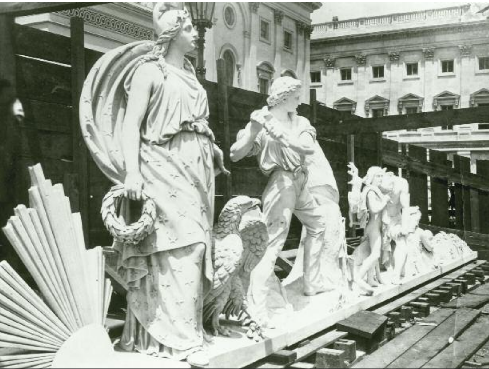
Fig. 6. Thomas Crawford represented America as a woman wearing a liberty cap in a figure in his sculptural group, Progress of Civilization , for the Senate pediment. The statues were modeled in 1854, carved at the Capitol in 1855-59, and installed in 1863.

1790s. This association was well established when Crawford was commissioned to design a statue for the top of the Capitol dome. In fact, Walter's first design for the Capitol dome showed Liberty bearing a liberty cap atop a pole.