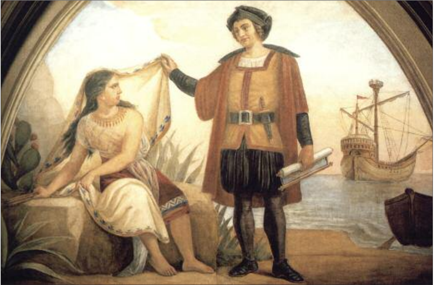
Fig. 3. Columbus lifts the veil of an Indian maiden, symbolizing the European discovery of America, in Constantino Brunidi's mid-1870s mural in the Senate wing of the Capitol.

songs, slogans, and engravings in cities along the Atlantic seaboard, Paul Revere and other artists helped to forge America's sense of identity by depicting America's first national symbol as an American Indian woman, long before the image of Uncle Sam took hold in the mid-1850s. This Indian princess image became fused with the allegorical European figure of Liberty or Minerva to create a new composite personification given various titles but expressive of the new American liberty through representative government. 7