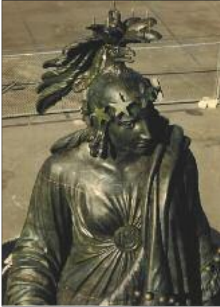
Fig. 13. In 1993 a helicopter lowered the Statue of Freedom to the east front plaza where conservators repaired pitting and corrosion on the bronze surface and restored its bronze green patina.