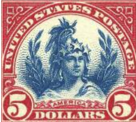
Fig. 11. The Statue of Freedom has been given many names. In this 1925 U.S. postage stamp, she is called America.