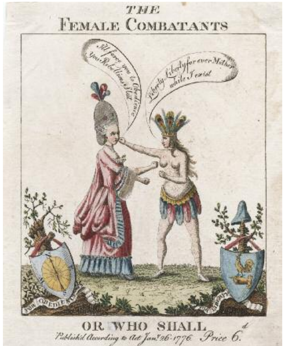
Fig. 5. America, in the form of an Indian maiden, resists the imposition of British authority in this 1776 etching, “The Female Combatants.”