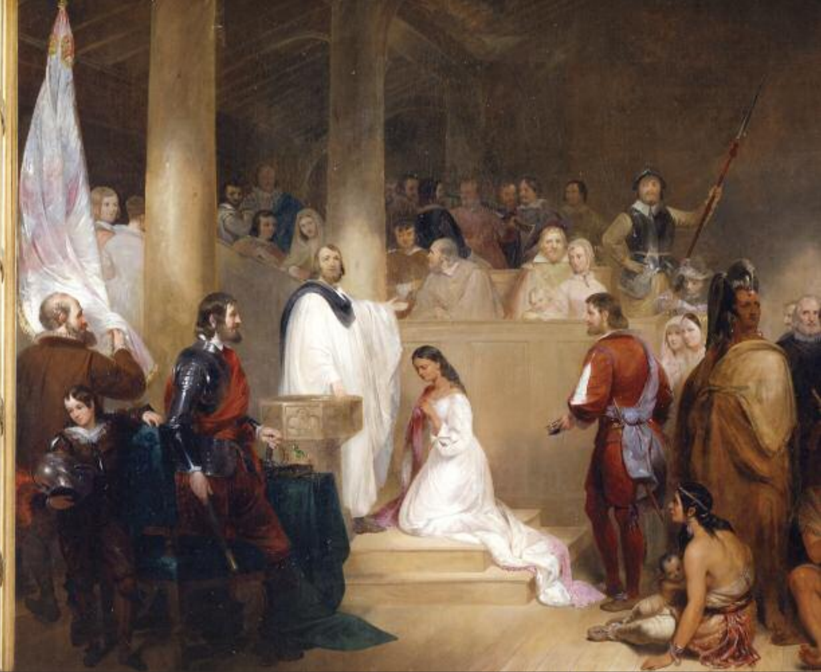
Fig. 4. John G. Chapman's 12-foot by 18-foot painting, The Baptism of Pocahontas , was installed in the Capitol rotunda in November 1840. Note the figure of her brother, Nantequas, clothed in robes and bearing an eagle headdress as he turns his face from the ceremony. Thomas Crawford would later adapt the eagle headdress for the Statue of Freedom.

tant place in American cultural history, especially because of its roots in the founding of the Virginia colony and the planting, harvesting, and curing of tobacco for its financial success. 11